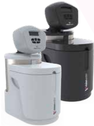
MonoBloc - SMALL