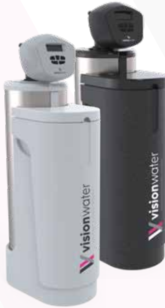
MonoBloc - LARGE